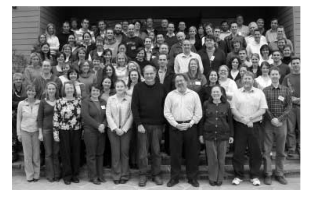
The Epilepsy Research Centre team and our collaborators at the 2006 Epilepsy Research Retreat

Our website, www.epilepsyresearch.org.au, provides a range of information about the Epilepsy Research Centre, the research projects we are conducting and also information for epilepsy patients interested in seeking treatment at Austin Health. Past issues of the newsletter and links to other useful sites can also be found. If you would like to contact us with any specific queries about our research or any of our studies, please email us at epilepsy-austin@unimelb.edu.au.