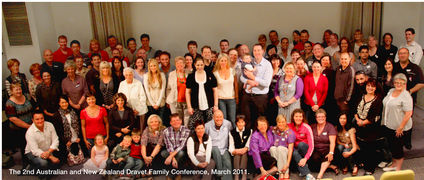
The 2nd Australian and New Zealand Dravet Family Conference, March 2011.